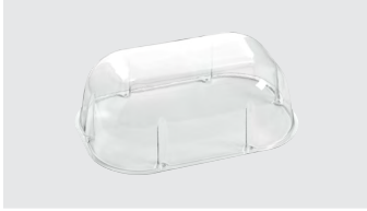
DIMENSIONS: 15" x 22" x 7-3/4"