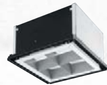
1' x 1' (Recessed only)