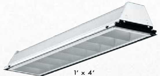
1' x 4'