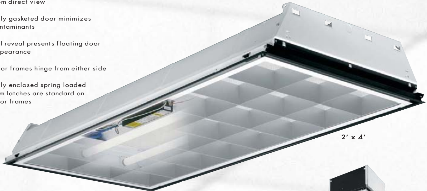
2' x 4'

The Blade louvered troffer is designed around Williams' specification grade Efficiency Plus™ housing for exceptional performance and durability. 2" deep cross blade louvers add the touch of class and beauty that set The Blade apart. Selection of louver colors, lamp options, louver cell combinations, and fixture sizes give you the flexibility to express your creativity while achieving the desired lumen package.