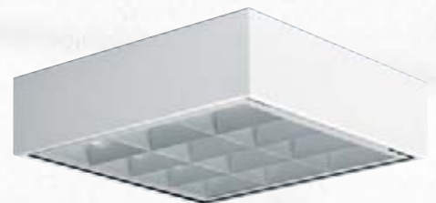
2' x 2' (Surface mount shown)