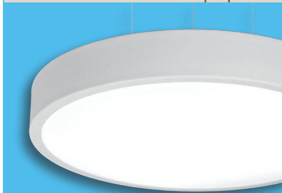
RNDP-2 shown with FFA